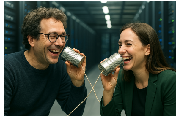
sovereign data pipelining, intelligence and key performance

Ecoflexx/QuickWork joint solutions provide a sovereign, modular integration platform for KPI- and AI-driven workflows. The setup scales flexibly from lightweight Docker modules to full iPaaS and on-prem deployments. Easily connect legacy systems and real time data to modern AI platforms with full control and enterprise-grade compliance.